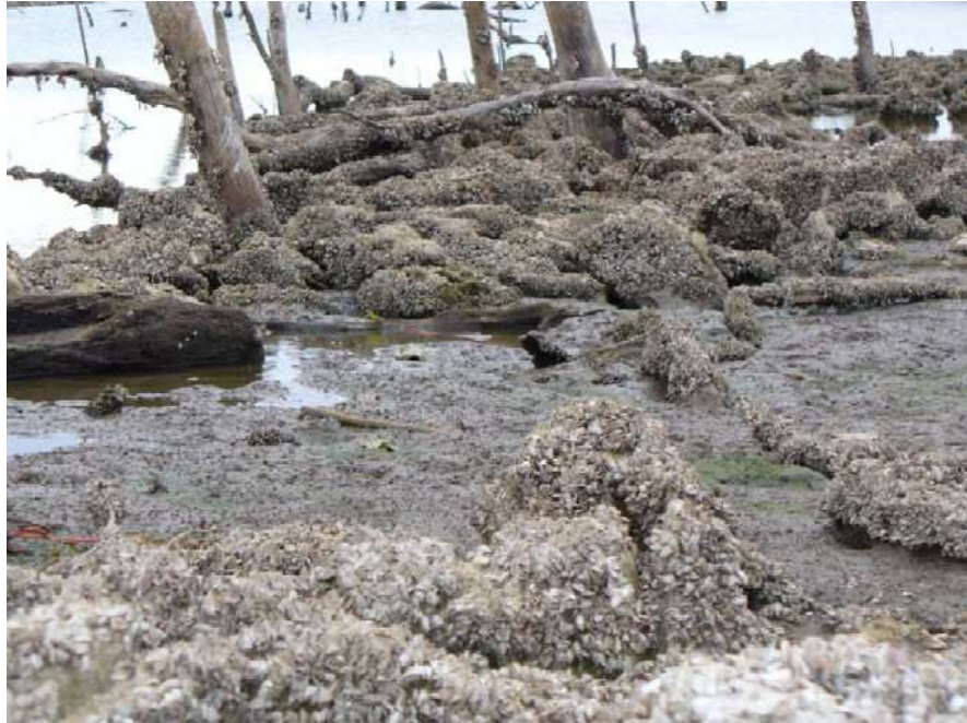
View of exposed zebra mussels at a Kansas reservoir after a lake drawdown.