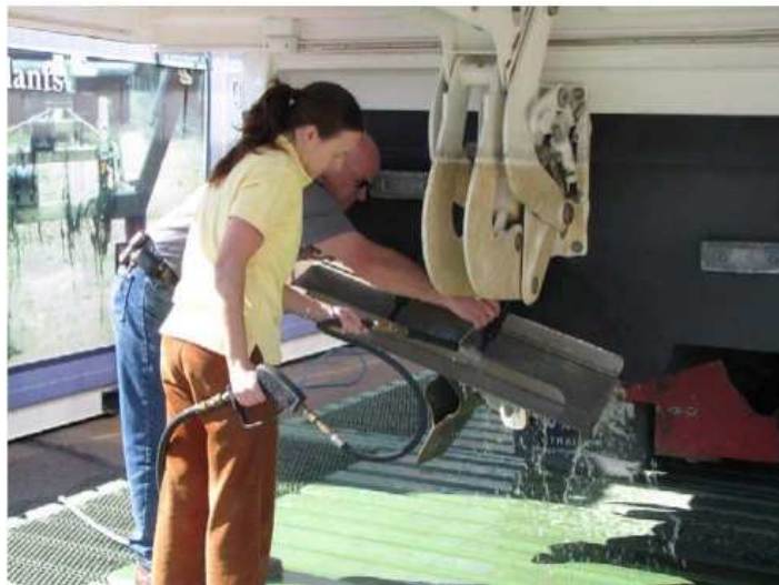
A boat being decontaminated

Budget justification: Current research at the Bureau of Reclamation on mussel resistant coatings are demonstrating costs that are three times greater than previously used coatings.