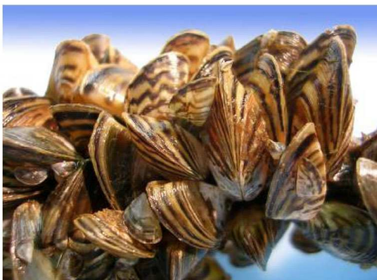
Zebra mussels ( Dreissena polymorpha )