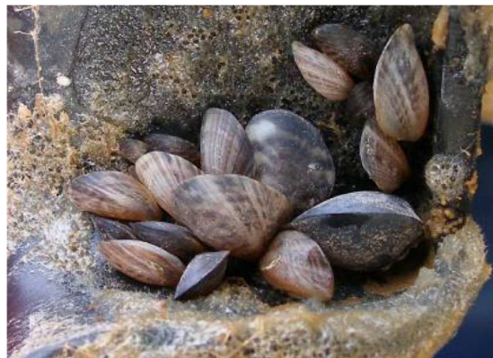
Quagga mussels ( Dreissena bugensis )