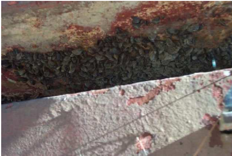
Zebra mussels on a trailered boat (view under the trim tab) intercepted while entering California in 2002.

For more expansive Dreissenid Biology and Background, please see Appendix C.