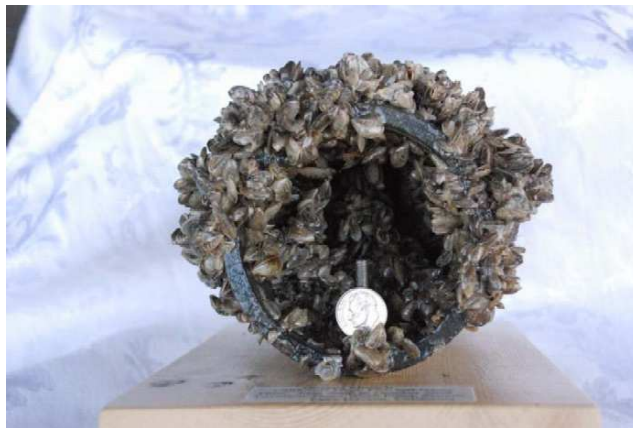
Pipe encrusted with zebra mussels.

A dedicated rapid response fund is necessary to rapidly implement containment at state or federal waters newly infested with quagga and/or zebra mussels. This fund would help States and other jurisdictions organize and begin implementing immediate actions while they work with